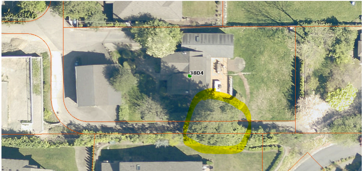
Image 2. An overview of the subject parcel with the previously removed tree circled in yellow.

No stump or visible remnants of the trees remained on-site during the field inspection. Google Maps Streetview tool was used in order to determine the approximate size of the tree prior to its removal. The imagery was captured in August 2011. The tree appears to have been a tall-statured Western red cedar ( Thuja plicata ). Using other site objects and features as a reference, the estimated size (DSH) of the tree prior to its removal ranges from 26-30 inches. The image of the tree is included on the next page of the report.