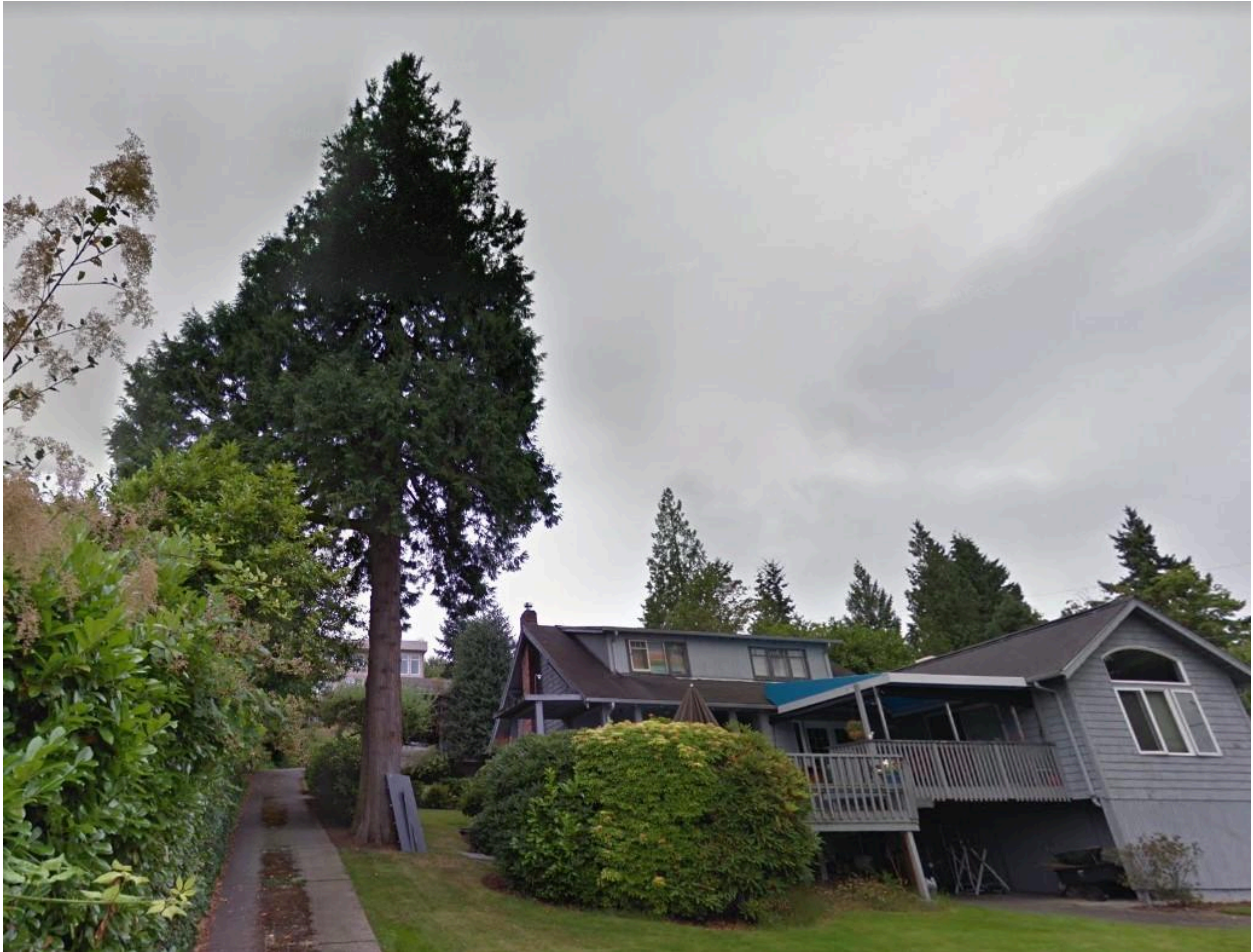
Image 3. Google Maps Streetview imagery of the removed tree dated August 2011.